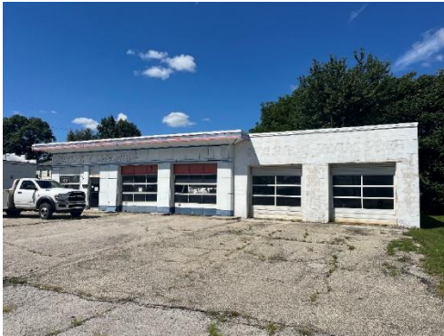
Before – 301 N Main