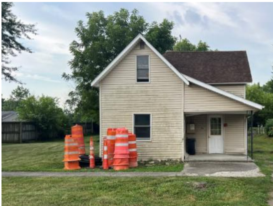
Before – 207 W Bomford St