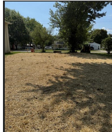
After – 246 W Ottawa