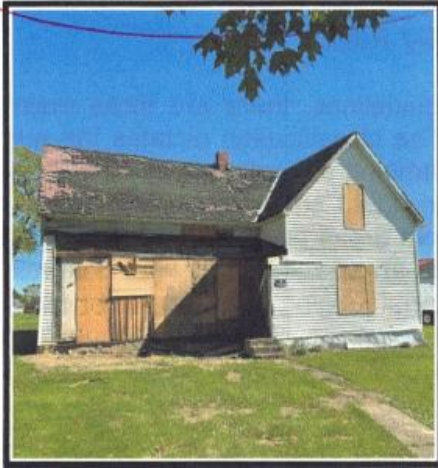
Before – 17100 Allen Center Rd