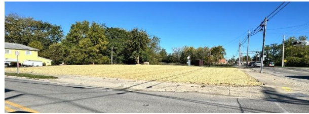
After – 301 N Main