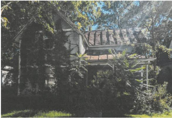
Before – 134 Beatty Ave