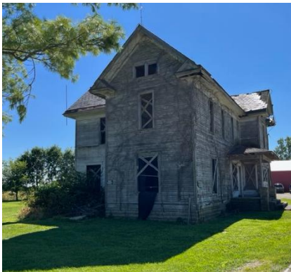
Before – 9964 Mitchel Dewitt