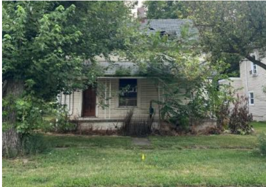
Before – 246 W Ottawa