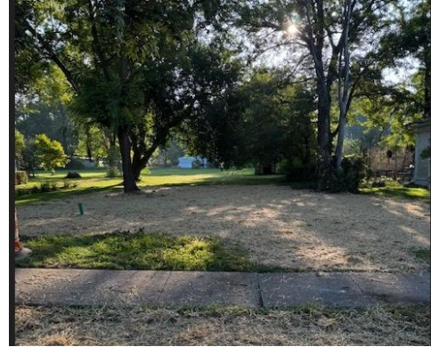
After – 134 Beatty Ave